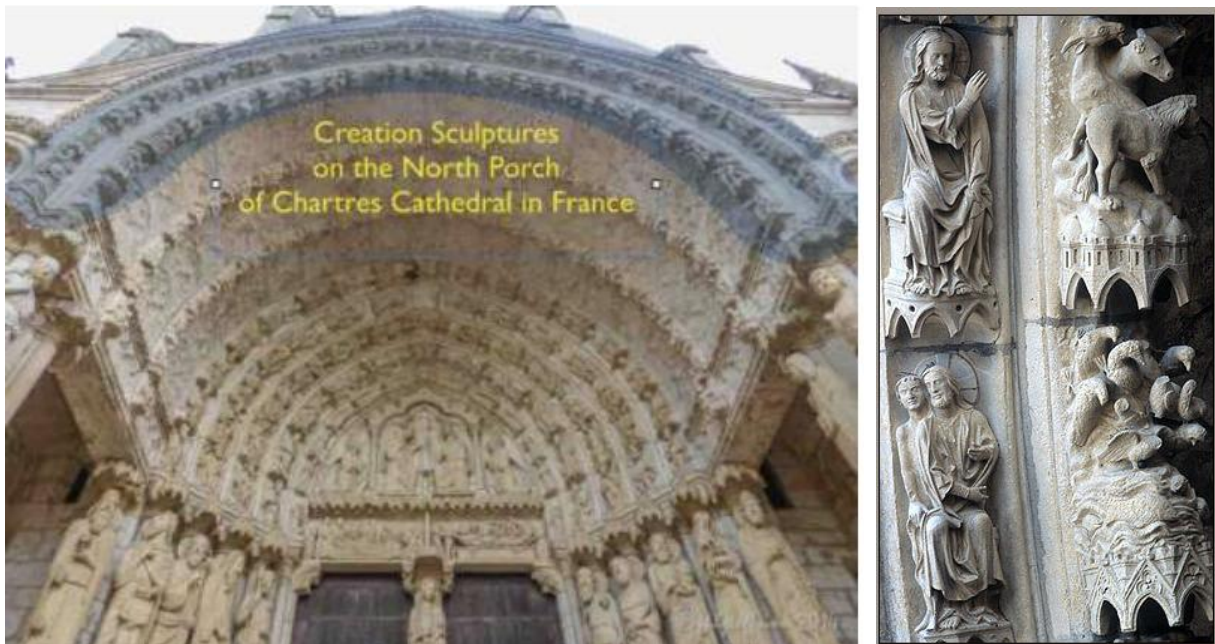
Figure 1. The small sculpture of God thinking about man in His Mind is located on the left side of the North Porch, central Bay archivolt, next to the creation of birds. See my report: 10. MAN IN THE IMAGE OF GOD THE CHARTRES CATHEDRAL.pdf ( amatterofmind.org )

The Chartres sculpture is very discrete and non-assuming, because this is how creativity works. My wife brought this discovery to my attention after a trip she made to the Chartres Cathedral in 1996. To this day, we still use this artistic composition as an axiom buster of the first order, because the significance of this discovery is the irony that is embedded in it.