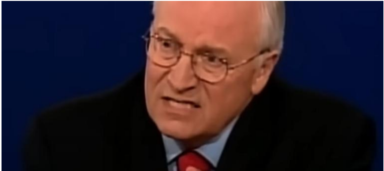
Figure 5. Satanist rage of former U. S. Vice-President, Dick Cheney

I expand, here, on what I wrote in my one page flyer of June 22. President Putin said: “Sometimes, I get the impression that European politicians and representatives of the European bureaucracy are more afraid of falling out of favour with Washington than losing the trust of their own people.” 6 Here, Putin has chosen a third way. What kind of face are you making when you hear that? That’s the complex opposition in hatred as in love: rage is to fear as boldness is to timidity.